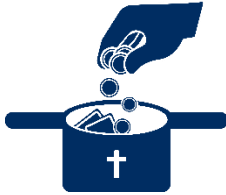
World Evangelism Fund