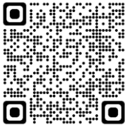
Gifts from the Heart