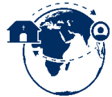
Care and Connection (missionary care)